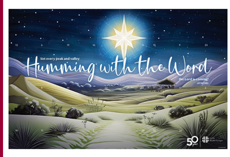
ELCA World Hunger Advent Calendar 2024

Celebrate the excitement, anticipation and wonder of the birth of Christ with this Advent calendar. Each day is a reminder of the reason for the season with hymns, prayers, Bible verses and information about how ELCA Good Gifts make a difference in the world. Go online to the ELCA website to download your copy today!