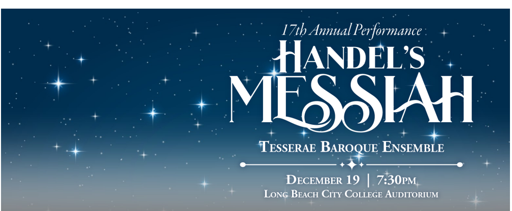
Long Beach Camerata Singers present Handal's Messiah. Won't you join us?

We have a sign-up sheet at Church and the tickets are only $30.00! It is at Long Beach City College (Clark Ave Campus) in their newly remodeled auditorium, Thursday , December 19 at 7:30 pm .