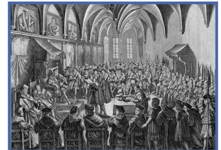
Presentation of Augsburg Confession

In the sixteenth century there was no nation called Germany. Rather, the various duchies and electorates made up a key part of the Holy Roman Empire, a remnant of the European territory once governed by ancient Rome. For much of Reformation times, Charles V governed as Holy Roman Emperor. He had watched his empire become increasingly fractured by divisions among princes favorable to Luther and other reformers, and those who kept their loyalty to Rome and the pope. The emperor needed the princes to be unified, not least because a Turkish invasion of Europe had reached the gates of Vienna. And so, in January 1530, the emperor called for a diet, or general assembly, in the German city of Augsburg. He asked the German princes and imperial cities to explain their religious convictions.