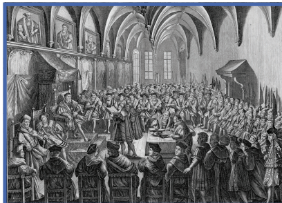
Presentation of Augsburg Confession

In the sixteenth century there was no nation called Germany. Rather, the various duchies and electorates made up a key part of the Holy Roman Empire, a remnant of the European territory once governed by ancient Rome. For much of Reformation times, Charles V governed as Holy Roman Emperor. He had watched his empire become increasingly fractured by divisions among princes favorable to Luther and other reformers, and those who kept their loyalty to Rome and the pope. The emperor needed the princes to be unified, not least because a Turkish invasion of Europe had reached the gates of Vienna. And so, in January 1530, the emperor called for a diet, or general assembly, in the German city of Augsburg. He asked the German princes and imperial cities to explain their religious convictions.