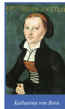
Katharina von Bora

Of all the Reformation mothers, the most famous is Luther’s beloved Katharina von Bora (1499–1552). She won the heart and admiration of Luther, who had orchestrated the escape of Katharina and eleven other nuns from their convent. As his equal “partner in calamity,” Katharina mothered their six children and managed the intricate finances and other affairs of their bustling household. Luther admitted that next to the Holy Spirit, he obeyed his wife-“lord,” Katharina.