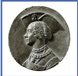
Argula von Grumbach

“I am prepared to lose everything, even life or limb. May God stand by me.” So wrote Argula von Grumbach (1492–1563/68?) from Bavaria, who found Martin Luther’s message of Christian freedom and equality empowering. This noble woman challenged an entire Catholic university in Ingolstadt in defense of Lutheran faith and a student persecuted for “Lutheran heresy.” This