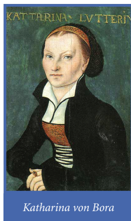
Katharina von Bora

Of all the Reformation mothers, the most famous is Luther’s beloved Katharina von Bora (1499–1552). She won the heart and admiration of Luther, who had orchestrated the escape of Katharina and eleven other nuns from their convent. As his equal “partner in calamity,” Katharina mothered their six children and managed the intricate finances and other affairs of their bustling household. Luther admitted that next to the Holy Spirit, he obeyed his wife-“lord,” Katharina.