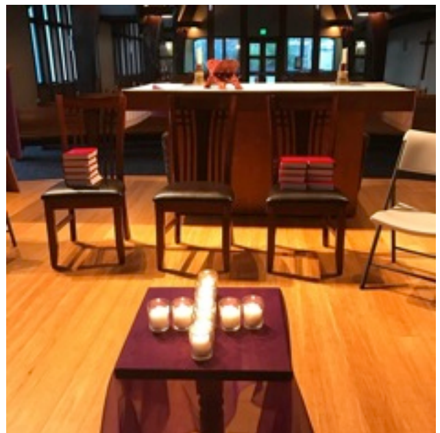
Wednesday Lenten worship.