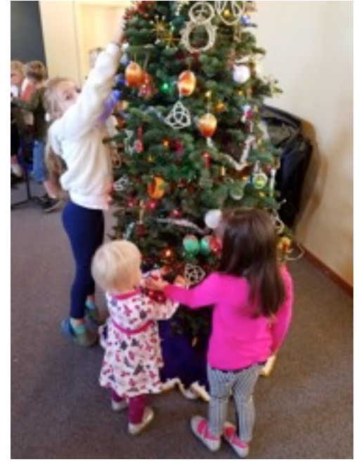
Christmas tree decorating and holiday fun after service at Holy Trinity.