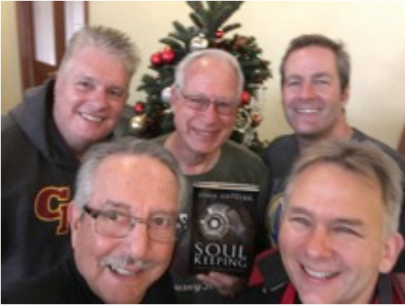
Saturday morning Men's Breakfast & Book Study this December. All men welcome!