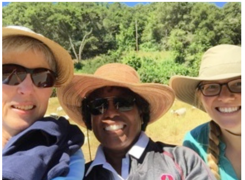
"Women Walking with Jesus" - Jezebels at Pulgas Ridge