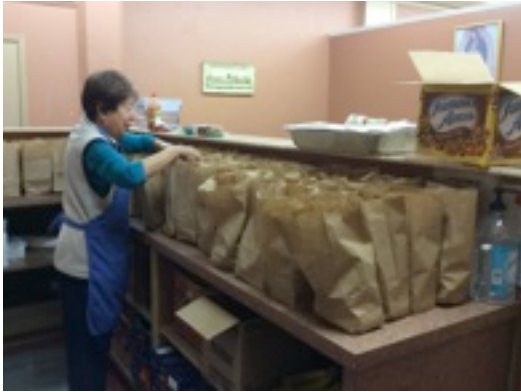
Soup kitchen at St. Vincent de Paul , SSF.

A fun day of service for "God's Work, Our Hands" Sunday, September 13! Together with Messiah Lutheran Church in Redwood City we prepped over 300 sandwiches for a soup kitchen, created 100 LWR School Kits for refugees, sang at an elder home, wrote letters to soldiers, and gave cookies to local fire-fighters!"