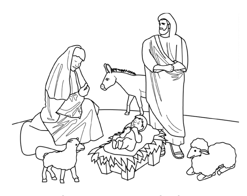
The Coming of the Christ Child