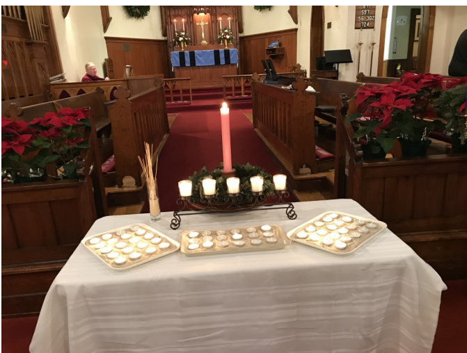
Candles were lit in memory of lost loved ones.