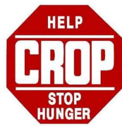
Crop walkers (& Walker)