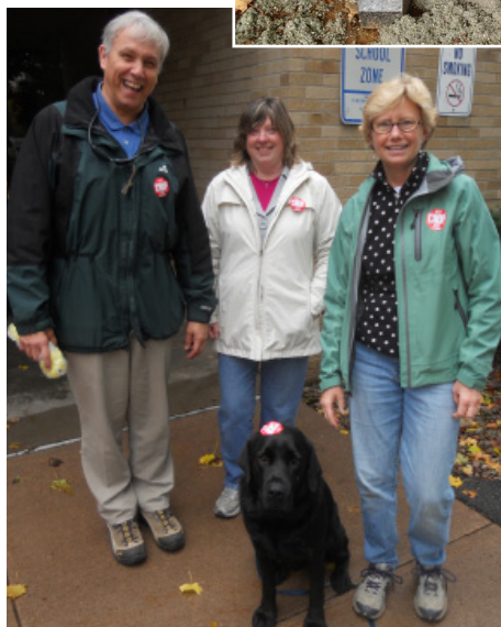
Sesquicentennial park bench dedication.