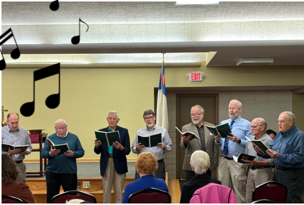
Men's Ensemble (above) and Chancel Choir (below) n Sunday Oct. 20– Laity Sunday.