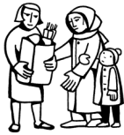
Feed the hungry