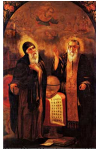
Saint Cyril and Methodius by Stanislav Dospevski, Bulgarian painter

http://www.catholic.org/saints/saint.php?saint_id=39 http://en.wikipedia.org/wiki/Saints_Cyril_and_Methodius