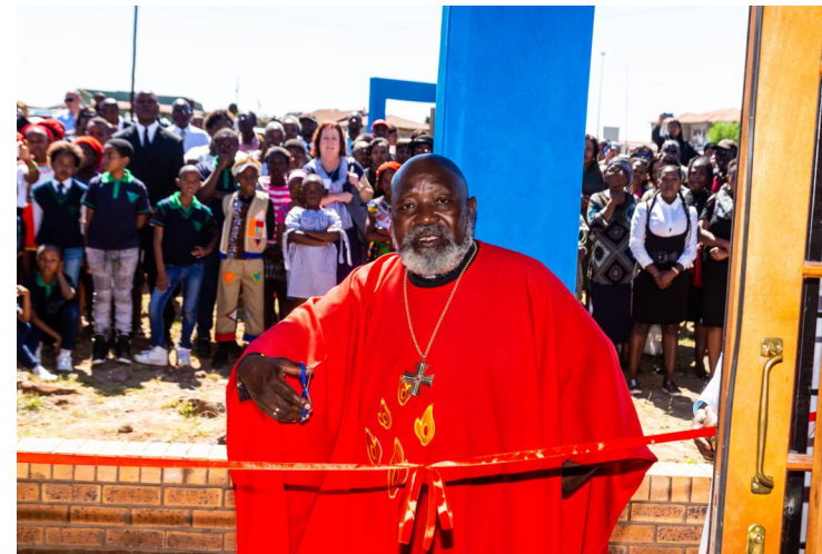
Bishop Mandla Khumalo is cutting the ribbon for the opening of the Caring Friends Eyeglass Clinic in South Africa.