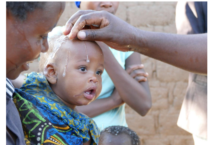
Team 1811 went to Tanzania and had the joy of baptizing 232 people in the 4 days they served.